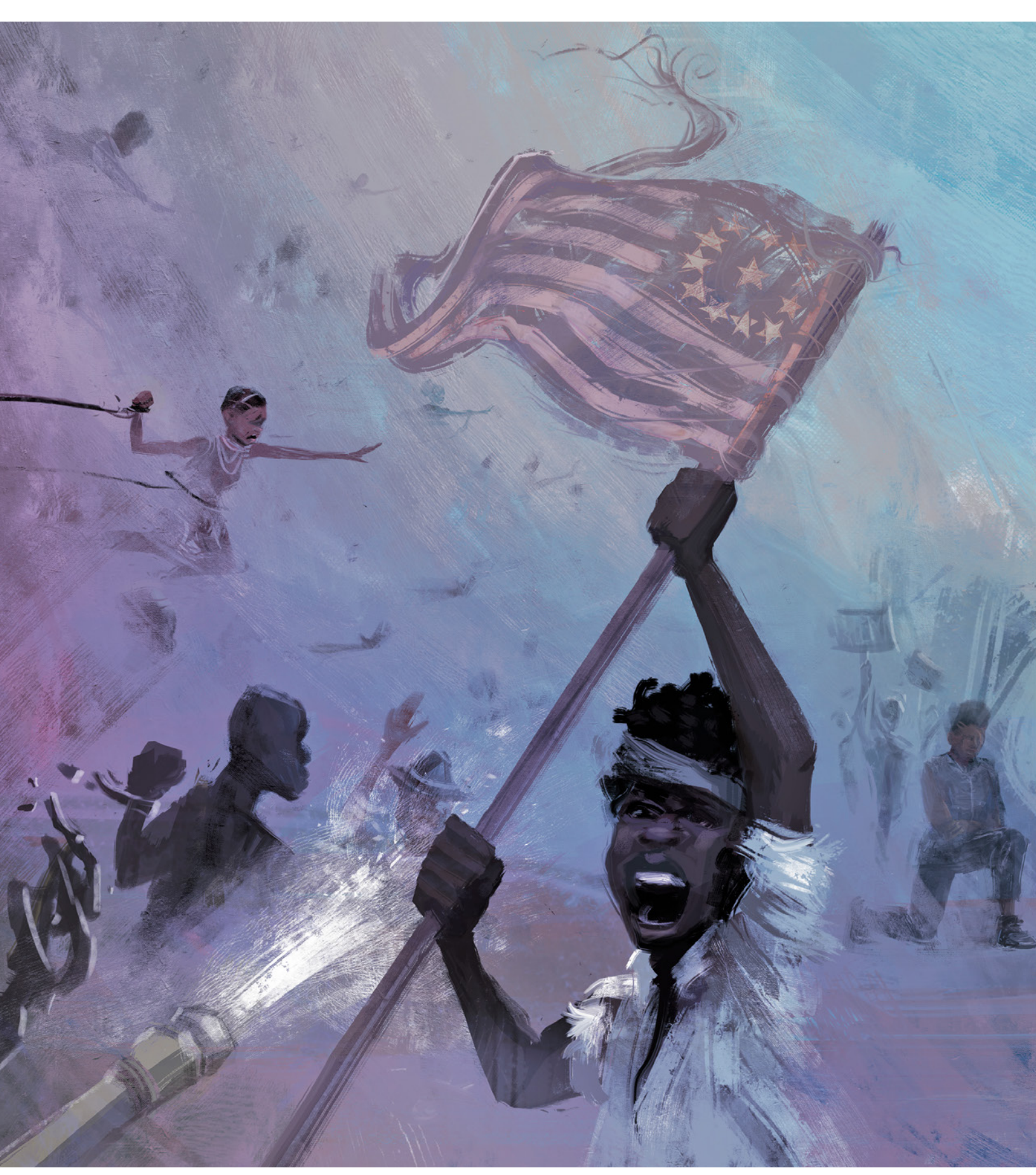
Artwork from The 1619 Project: Born on the Water © 2021 The New York Times Company